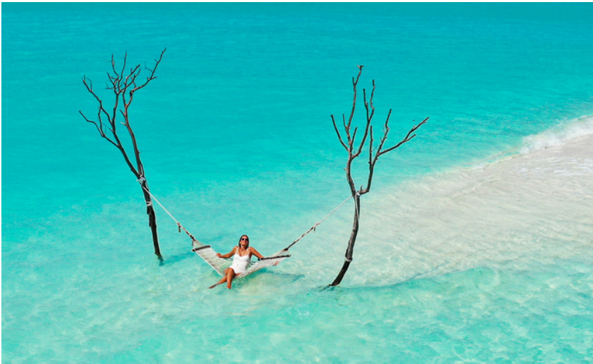
Hammock at the sandbank