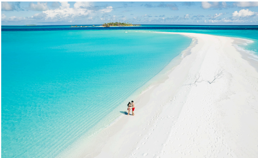
The beautiful sandbank during the daytime