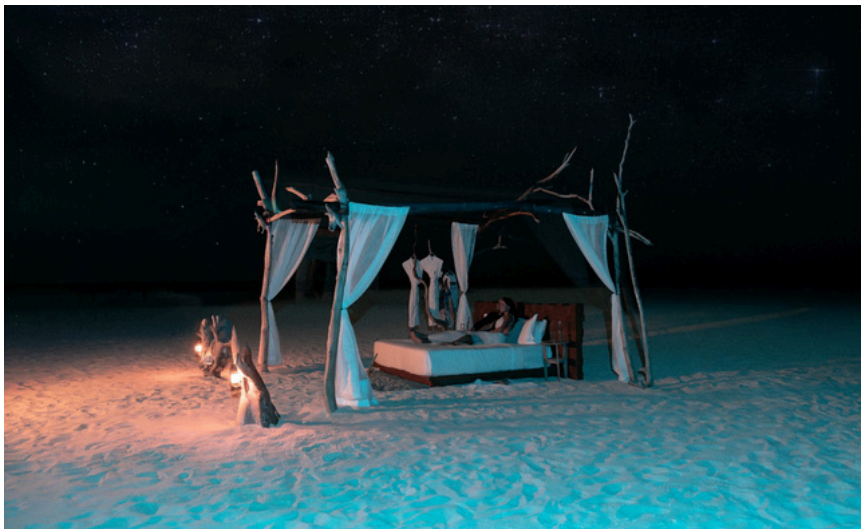
Sleeping Under the Stars