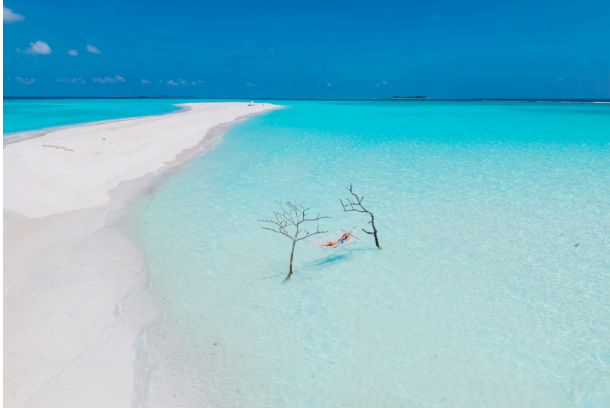
The beautiful sandbank during the daytime