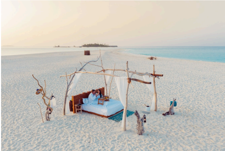
Complete Villa setup on the sandbank for Sleep Under the Stars experience