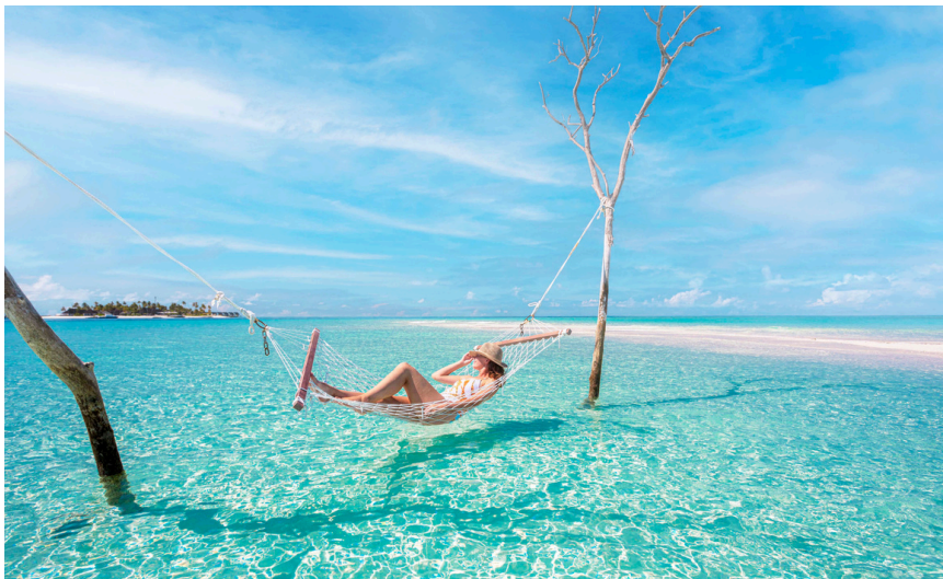
Hammock at the sandbank