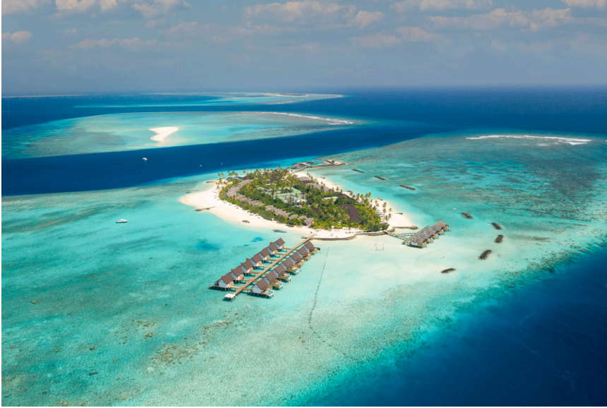
Aerial of Fushifaru and the sandbank