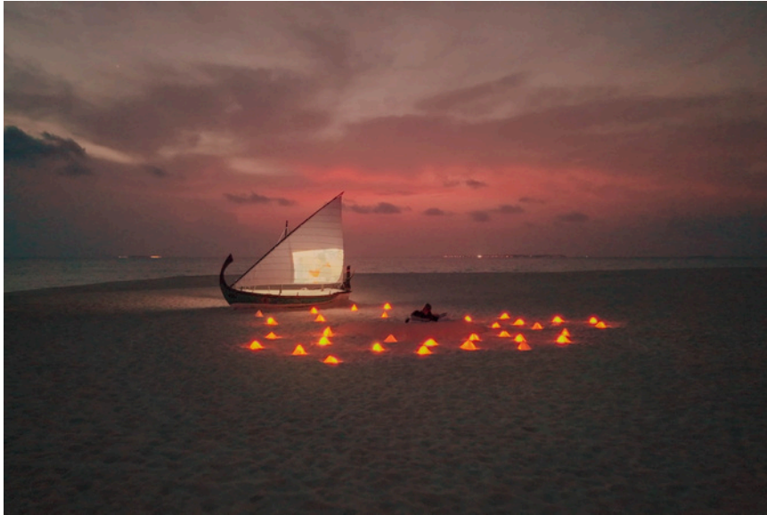
Movie Under the Stars